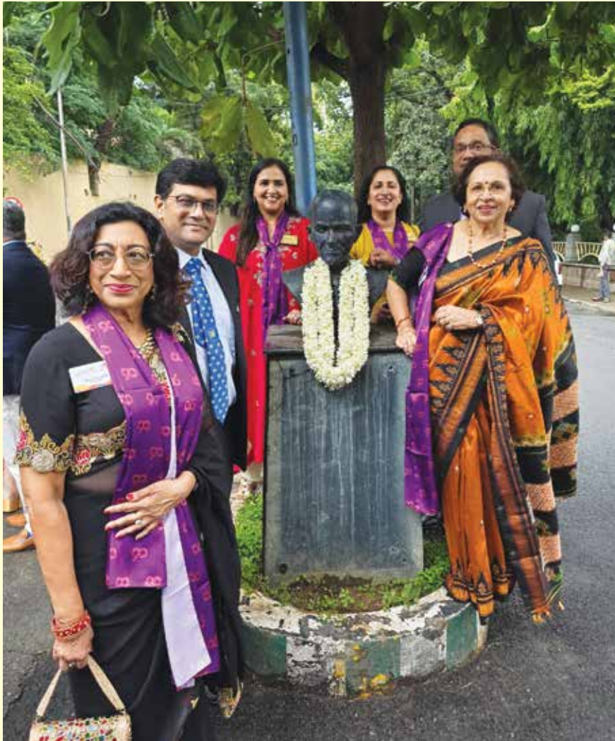
Garlanding the statue of Paul Harris, 50 m from the House of Friendship, the office event space of Rotary Club of Bangalore.